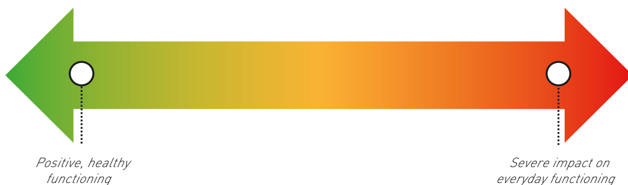
Figure 1: The mental health continuum

Everyone's mental health varies during their life. Mental health exists on a broad continuum or range, from positive, healthy functioning at one end through to severe symptoms or conditions that impact on everyday life and activities (see Figure 1 below).