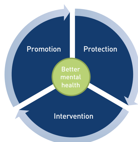
Figure 2: An integrated approach to mental health and wellbeing

Research suggests that these three approaches are complementary, and together they are an effective, comprehensive approach to mental health and wellbeing. 7 This integrated approach forms the foundation of the Good practice framework for mental health and wellbeing in first responder organisations .