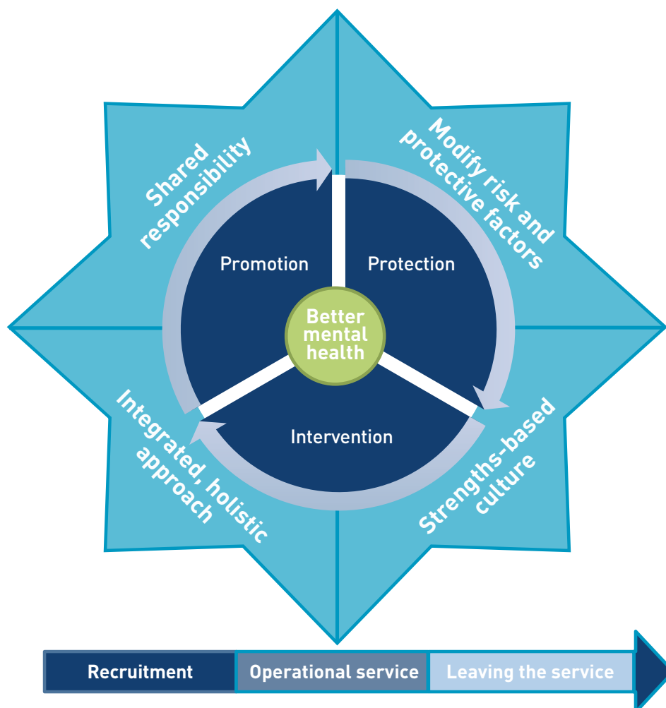
Figure 3: Good practice model for mental health and wellbeing in first responder organisations

The framework itself consists of five core areas of action and a complementary suite of actions – these are structured across the first responder's career. As part of developing and implementing an overarching strategy, each organisation should consider their specific risk profile to determine which actions are best suited to their situation.