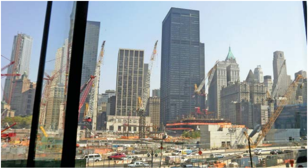
Ground Zero site under reconstruction September 2010

St. Paul's Chapel is situated beneath the trees at the extreme left bottom edge of the photograph.